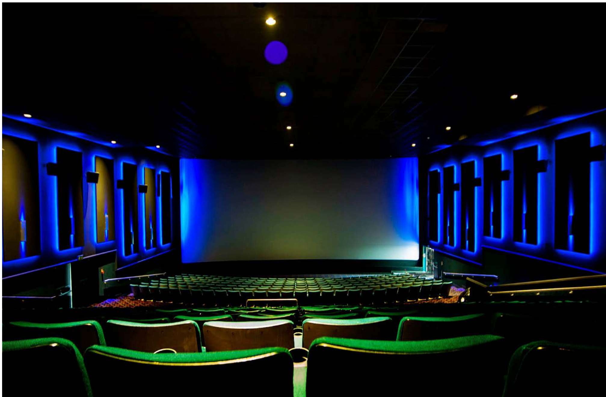
PRO-STRETCH FABRIC ACOUSTIC WALL TREATMENT SYSTEM | PRO-TECT IMPACT RESISTANT WALL CARPET FOR HIGH TRAFFIC AREAS