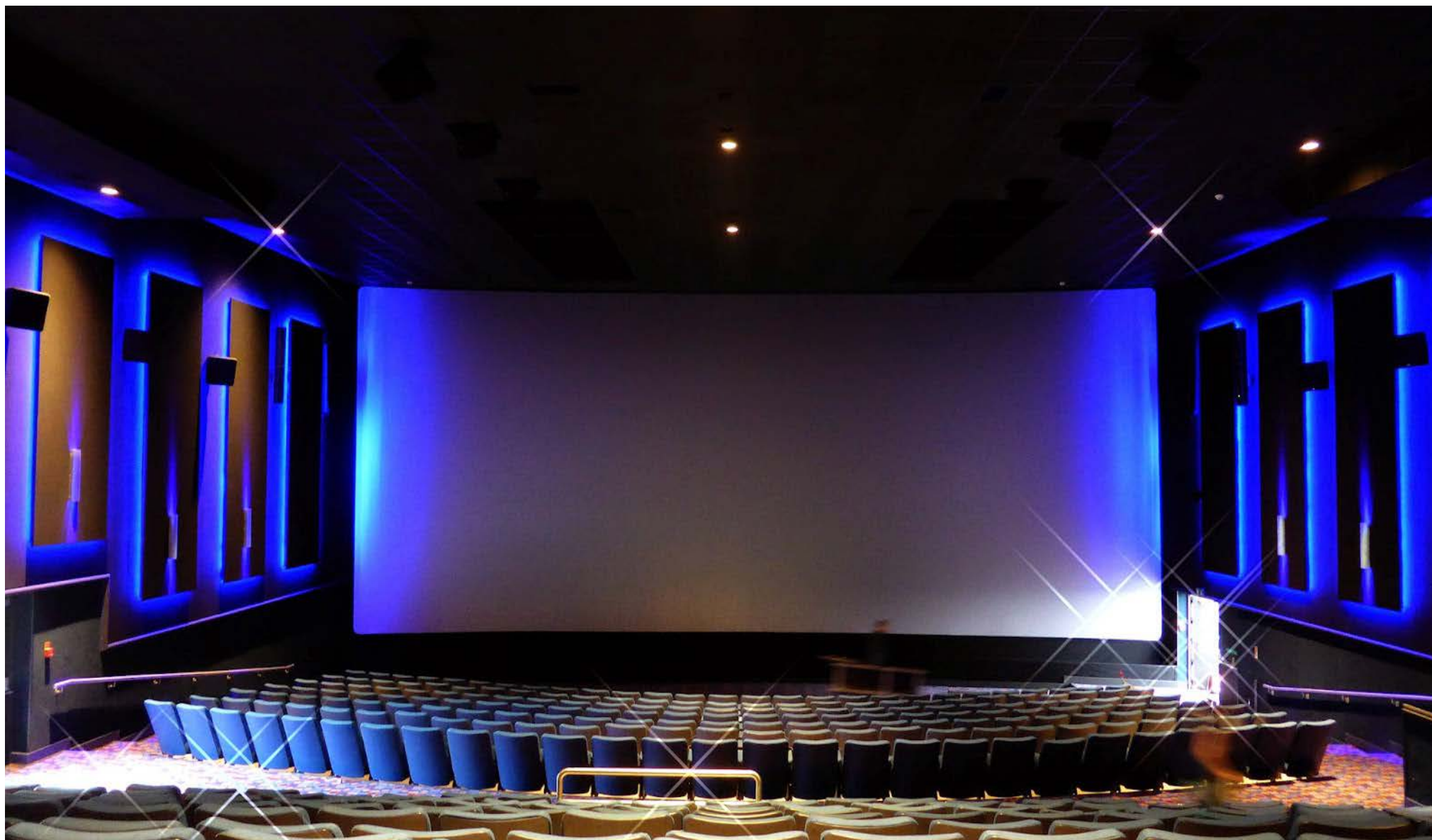
PRO-STRETCH FABRIC ACOUSTIC WALL TREATMENT SYSTEM | PRO-TECT IMPACT RESISTANT WALL CARPET FOR HIGH TRAFFIC AREAS